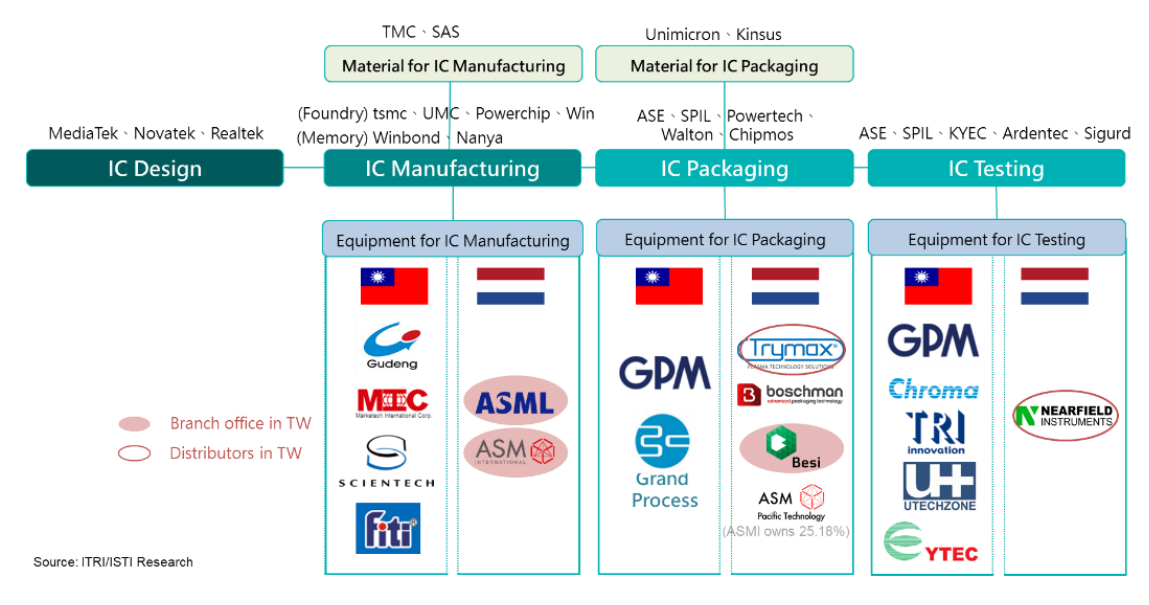
Figure 3-1. Taiwan's semiconductor industry chain and the semiconductor equipment suppliers in Taiwan and Netherlands