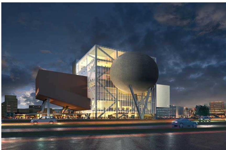
Concept design of the Taipei Performing Arts Centre by OMA

Another strong link with the Netherlands and the WDC 2016 is that one of the main venues, in which the signature event the International Design Policy Conference will take place, is the Taipei Performing Arts Centre designed by OMA from Rem Koolhaas. This building will be an important cultural venue in Taipei. Other famous Dutch Architecture companies like Mecanoo and Kossmann.dejong are involved in big architectural projects in Taiwan as well.