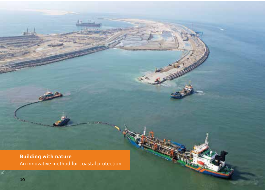
Building with nature An innovative method for coastal protection

pragmatic and open to new challenges, the Dutch have created a flourishing and resilient land. The Netherlands is a constantly evolving ecosystem of cities, industry, agriculture and nature, all integrated through smart infrastructure. It is a source of knowledge and experience that the Dutch are keen to share with others. Learning from the past to create a better future. Together, seeking sustainable solutions for the most liveable world.