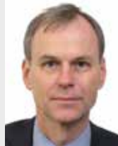
Marten van den Berg Vice-Minister for Foreign Trade

PO Box 20061 NL-2500 EB The Hague www.government.nl/ministries/bz