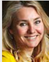
Melanie Schultz van Haagen

PO Box 20901 NL-2500 EX The Hague www.government.nl/ministries/ienm