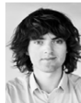
Boyan Slat CEO and founder

A typical example of our approach is the development of the National Capital Integrated Coastal Development master plan to protect Jakarta from sea-driven flooding. Sweco's approach of the master plan is to link water management to socio-economic improvements and investments. Solutions for sanitation, traffic congestion, water supply and controlled urban expansion offer Jakarta a new perspective for the future.