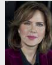
Cora van Nieuwenhuizen Minister of Infrastructure and Water Management

PO Box 20901 NL-2500 EX The Hague www.government.nl/ministries