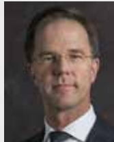
Mark Rutte Prime Minister

Prime Minister's Office PO Box 20001 NL-2500 EA The Hague www.government.nl/ministries