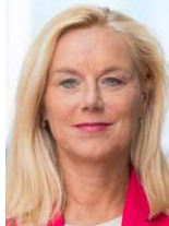
Sigrid Kaag Minister for Foreign Trade and Development Cooperation

PO Box 20061 NL-2500 EB The Hague www.government.nl/ministries/bz